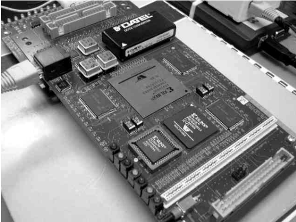
Fig. 1. The FPX platform used to implement HAIL

the FPX to directly process streaming TCP/IP network traffic flows in hardware [11].