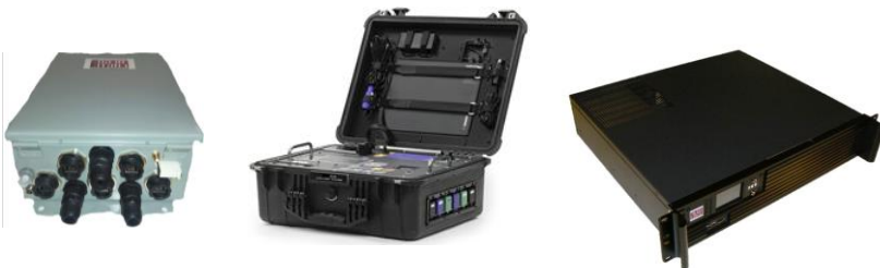
Black Diamond Industrial